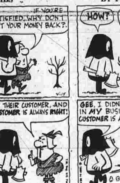
SHORT RIBS BY FRANK O'NEAL