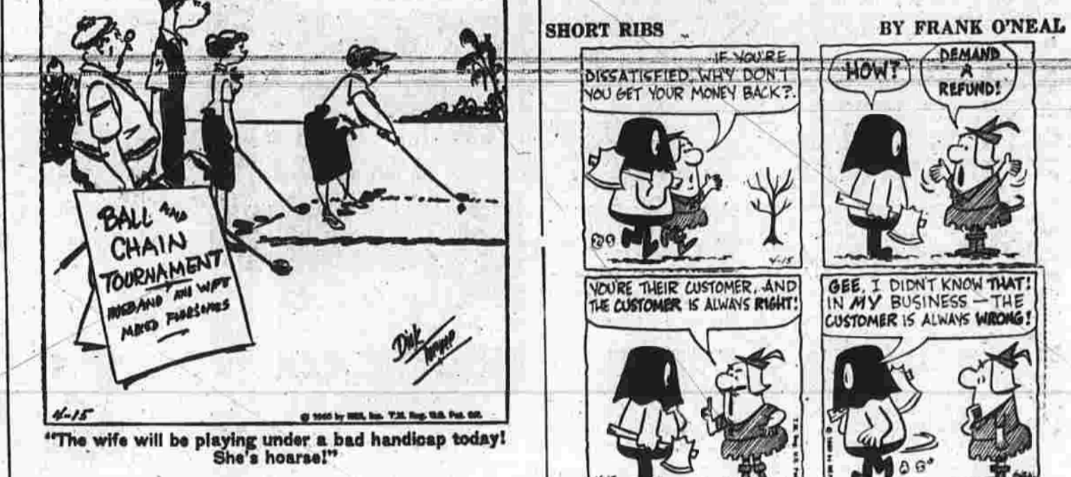
SHORT RIBS BY FRANK O'NEAL